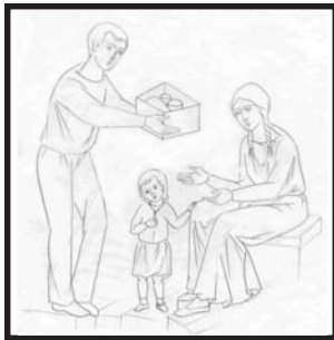
Feeding the hungry