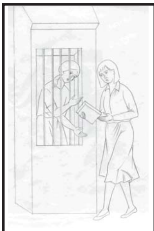
Visiting the imprisoned

I have been busy working on the parish icons. First, after figuring out the correct proportions for the panels, I purchased the wood. Parishioner Dick Hertel generously drove his panel truck to pick up the wood. Then he cut the panels and the support boards for the cradling on the back side. Because the painting process uses a great deal of water, large icon panels need to have support boards on the rear side to prevent warping. I brought everything home, glued and clamped the pieces on the back, allowed them to dry, and then applied wood screws to the cradling. The center panel is 41 1/4" x 60". The 2 side panels are 22 1/2" x 49 1/2". When the weather is consistently warmer, I will apply a minimum of 12 coats of gesso to the panels. Then they will be sanded smooth, dusted off, and ready for transferring the images onto their surfaces.